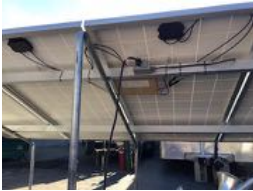
Daylight Inverter with power receptacle